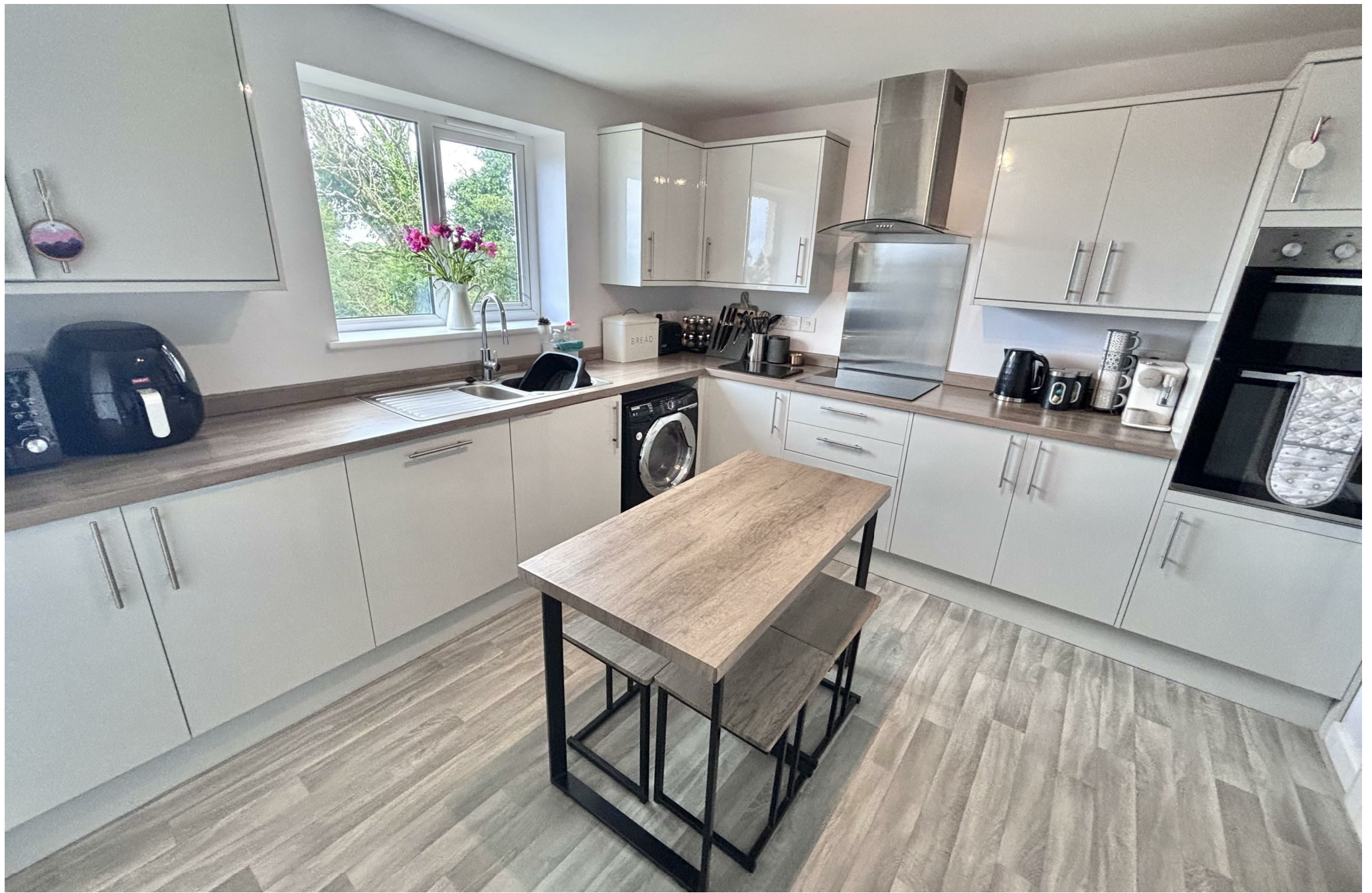
Lower Cargwyn Meadows, Penwithick, St. Austell, PL26 8FU